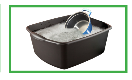
Never use with granulated dish detergent